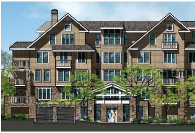
Building Exterior (Left Side)